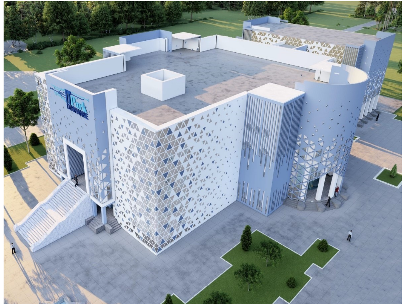
Demo & Start up